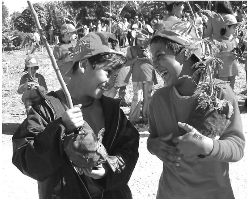
Children on an MST settlement participate in a tree planting Brazil VERONICA LEON