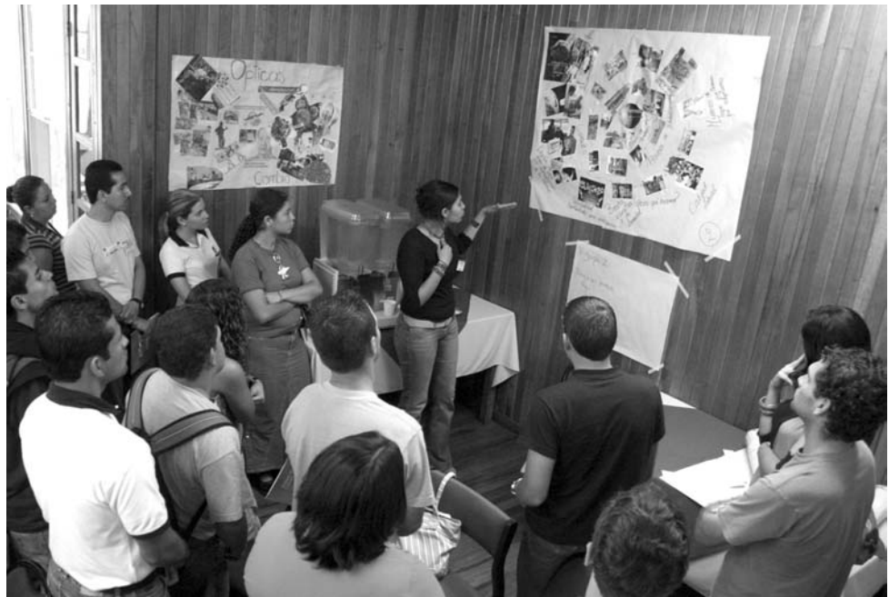
Meeting of Young Cooperative Members: presentation of group- work results. La Catalina, Costa Rica SULA BATSÚ