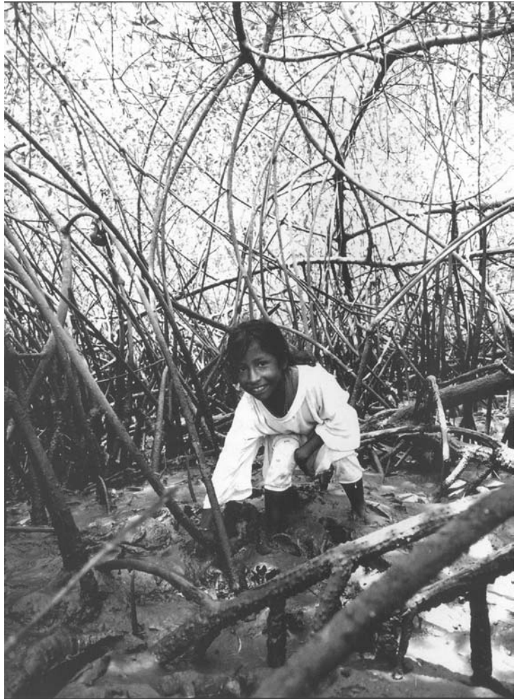
Girl engaged in adequate community use of the mangroves. Congal, Esmeraldas