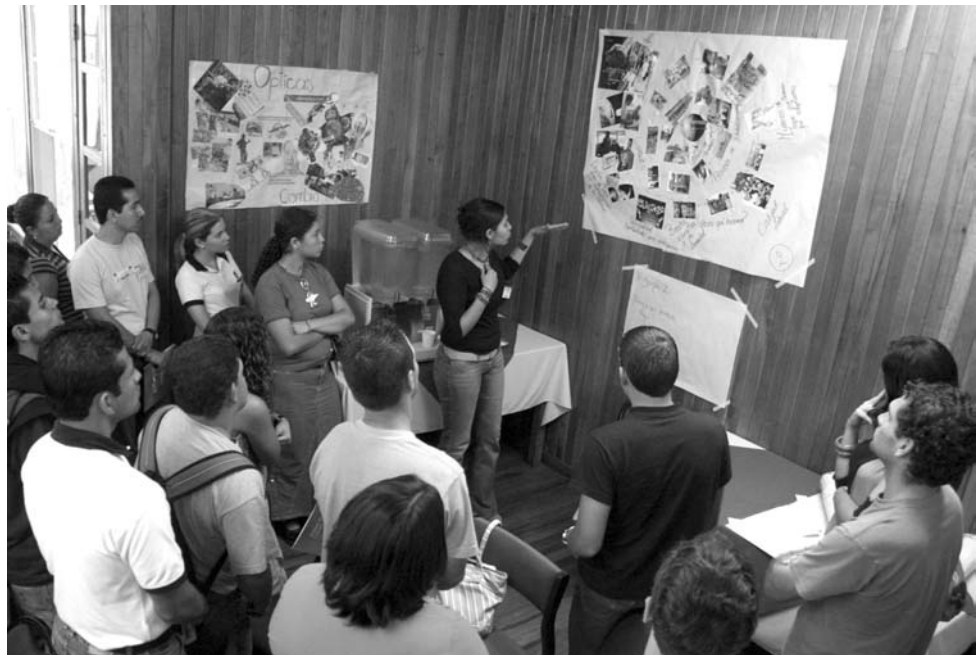
Meeting of Young Cooperative Members: presentation of group- work results. La Catalina, Costa Rica SULA BATSÚ