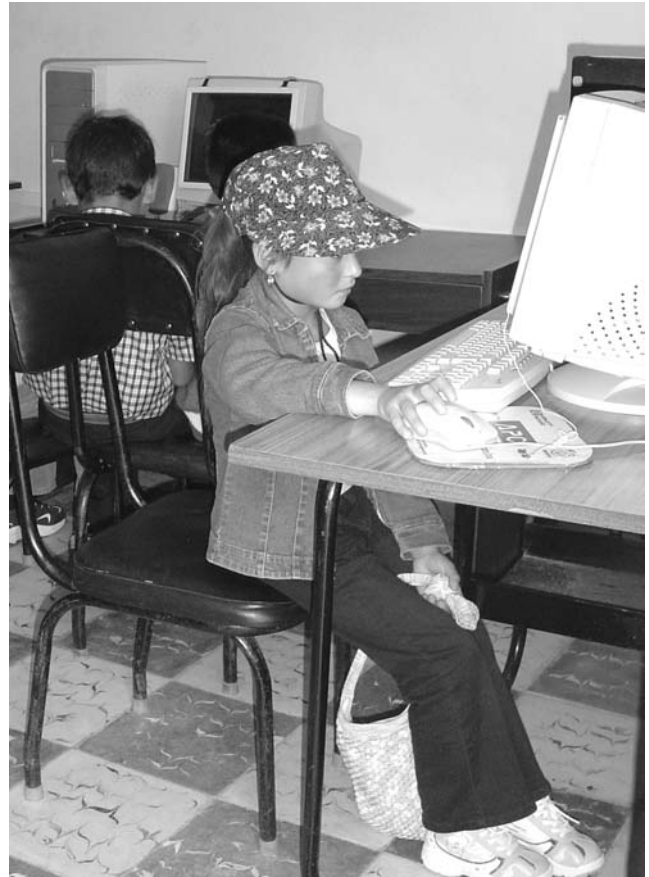
Pucara Telecentre, Azuay, Ecuador SOCIAL PASTORAL SERVICE OF CUENCA