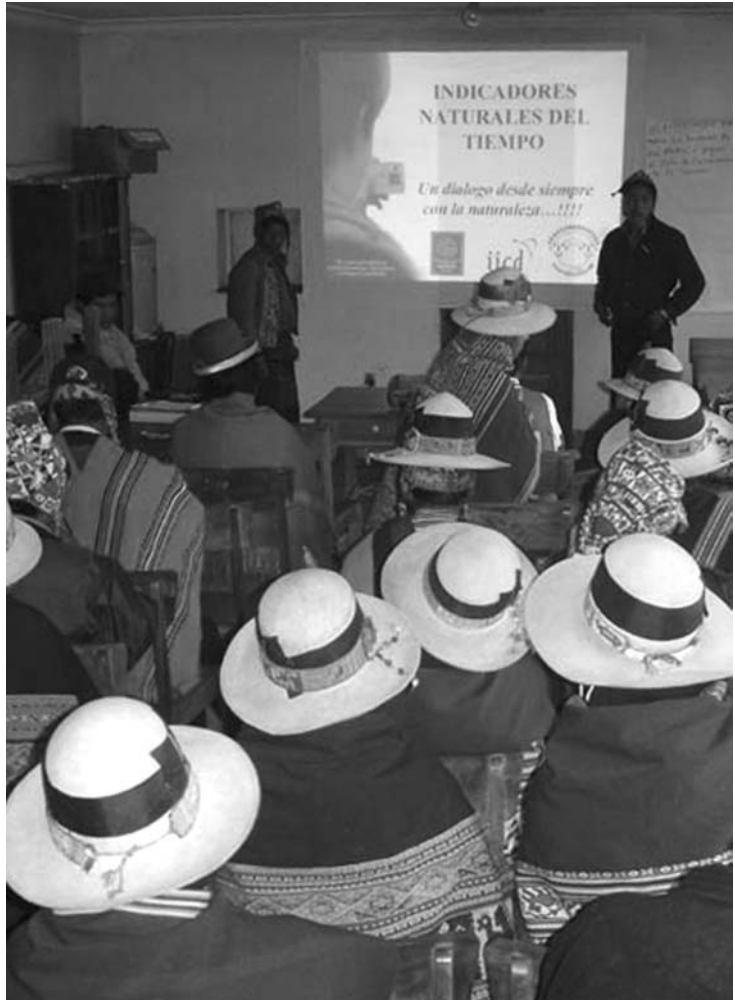
Bolivian communities share knowledge with the support of graphic presentations. AGRECOL