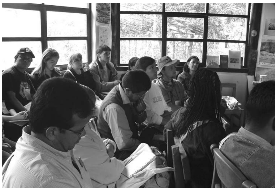
Exchange with the Network of Seed Guardians, Tumbaco, Ecuador